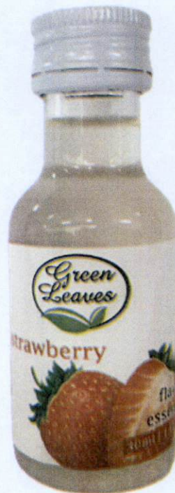
Figure 1. Unregistered GREEN LEAVES Strawberry Flavor Essence

The Food and Drug Administration (FDA) warns all healthcare professionals and the general public NOT TO PURCHASE AND CONSUME the following unregistered food products: