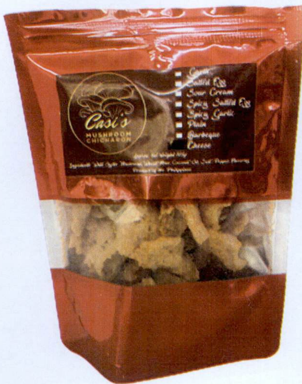
Figure 4. Unregistered CASI'S Mushroom Chicharon Cheese