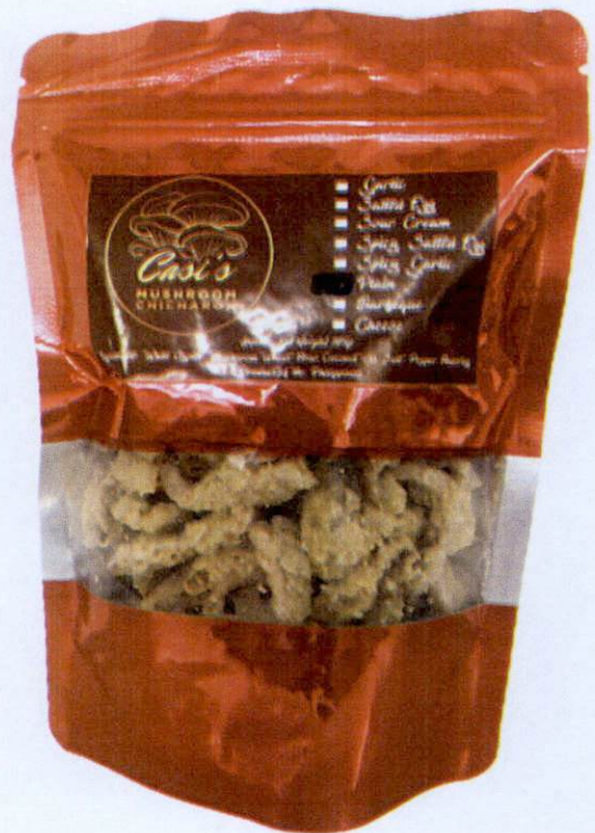
Figure 5. Unregistered CASI'S Mushroom Chicharon Plain