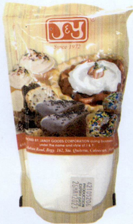
Figure 2. Unregistered J&Y FINEST QUALITY Baking Soda