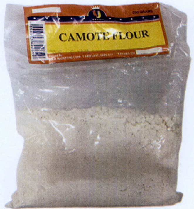
Figure 3. Unregistered TJ BRAND Camote Flour