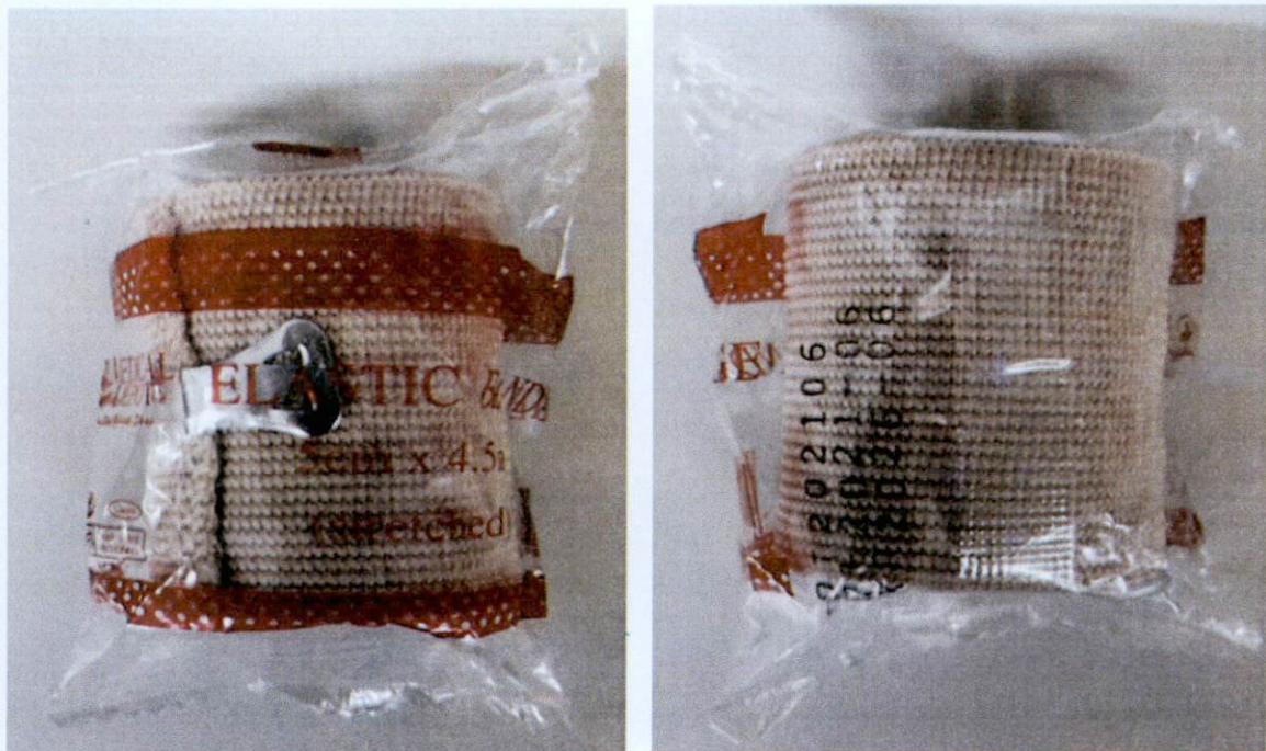
Figure 1. Unnotified Medical Depot Elastic Bandage 5cm x 4.5m (Stretched)

The Food and Drug Administration (FDA) warns all healthcare professionals and the general public NOT TO PURCHASE AND USE the unnotified medical device products: