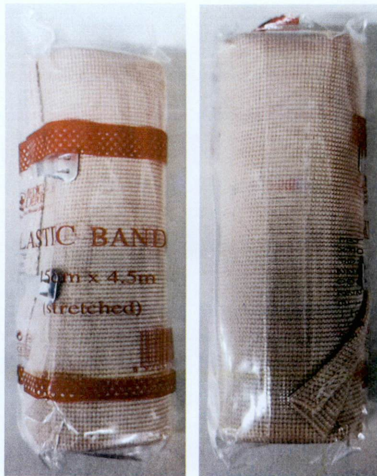
Figure 3. Unnotified Medical Depot Elastic Bandage 15cm x 4.5m (Stretched)