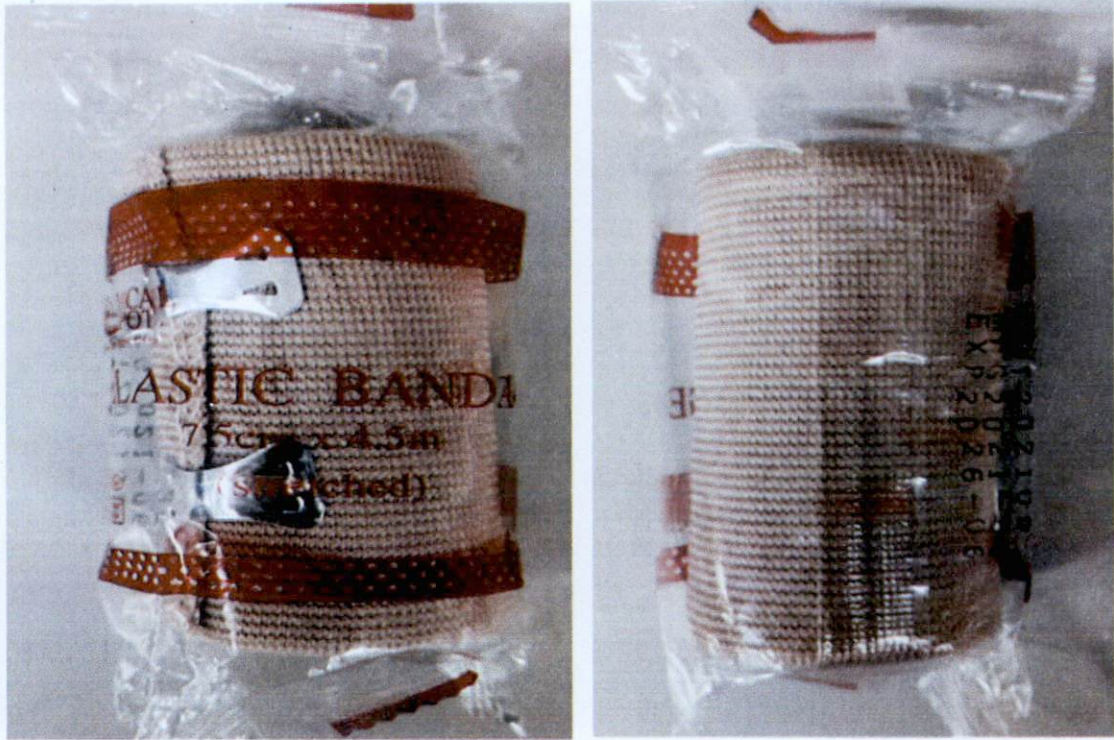
Figure 2. Unnotified Medical Depot Elastic Bandage 7.5cm x 4.5m (Stretched)