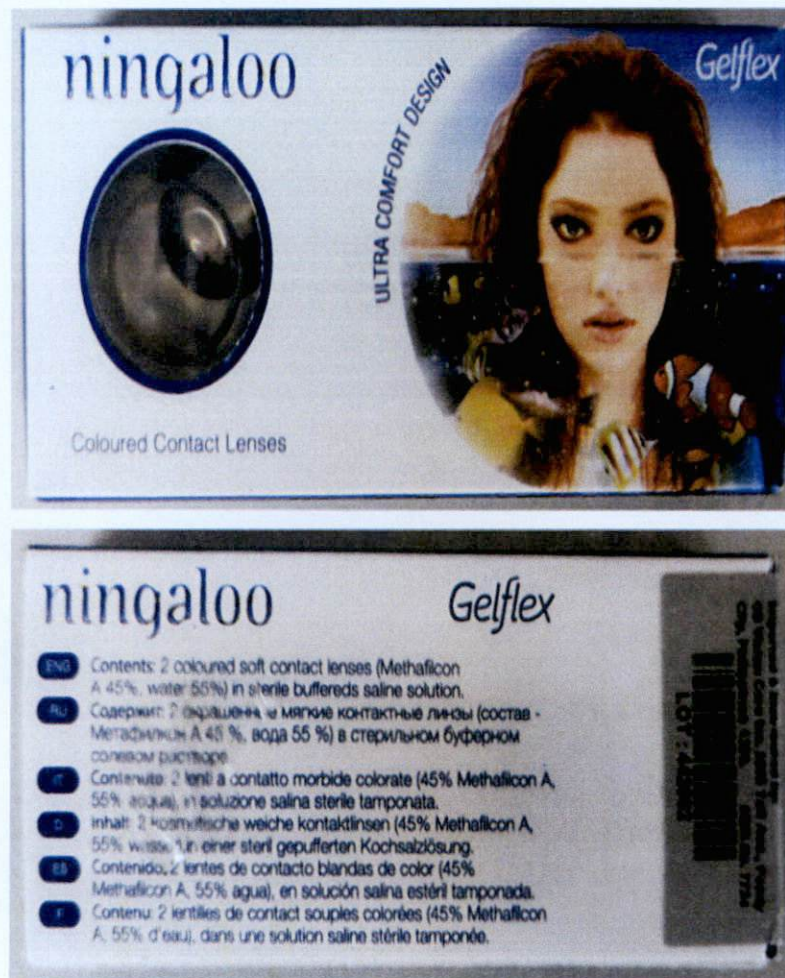
Figure 1. Ningaloo Coloured Contact Lenses with Expired Certificate of Product Registration

The Food and Drug Administration (FDA) warns all healthcare professionals and the general public NOT TO PURCHASE AND USE the medical device product with expired Certificate of Product Registration: