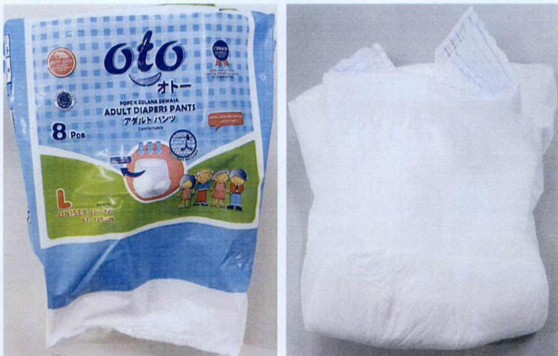
Figure 1. Unnotified Oto Adult Diaper Pants L 8pcs

The Food and Drug Administration (FDA) warns all healthcare professionals and the general public NOT TO PURCHASE AND USE the unnotified medical device product: