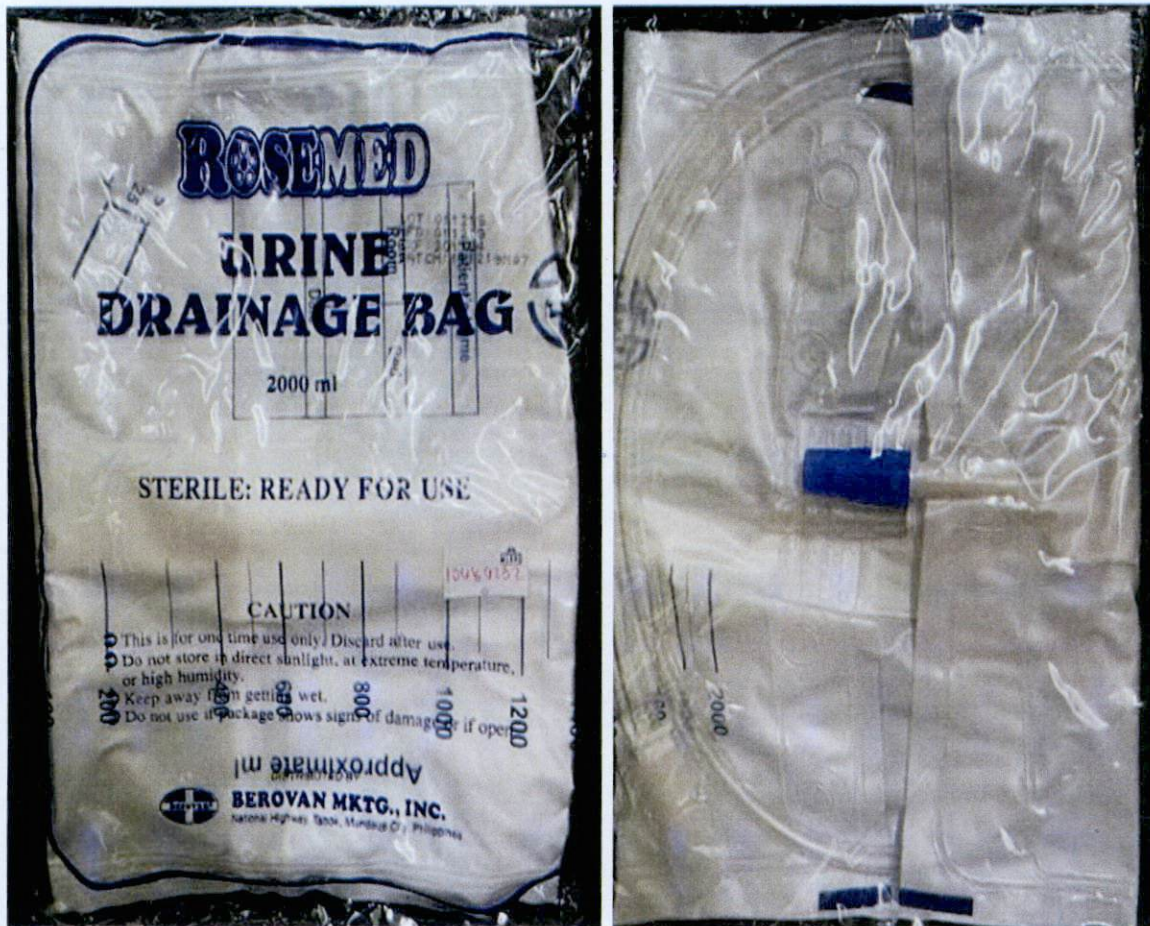
Figure 1. Unregistered ROSEMED URINE DRAINAGE BAG 2000ml

The Food and Drug Administration (FDA) warns all healthcare professionals and the general public NOT TO PURCHASE AND USE the unregistered medical device product: