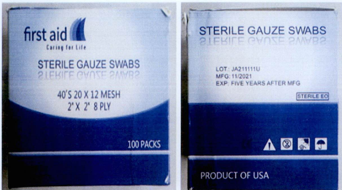
Figure 1. Unnotified First Aid Sterile Gauze Swab 40's 20x12 Mesh (100 packs)

The Food and Drug Administration (FDA) warns all healthcare professionals and the general public NOT TO PURCHASE AND USE the unnotified medical device product: