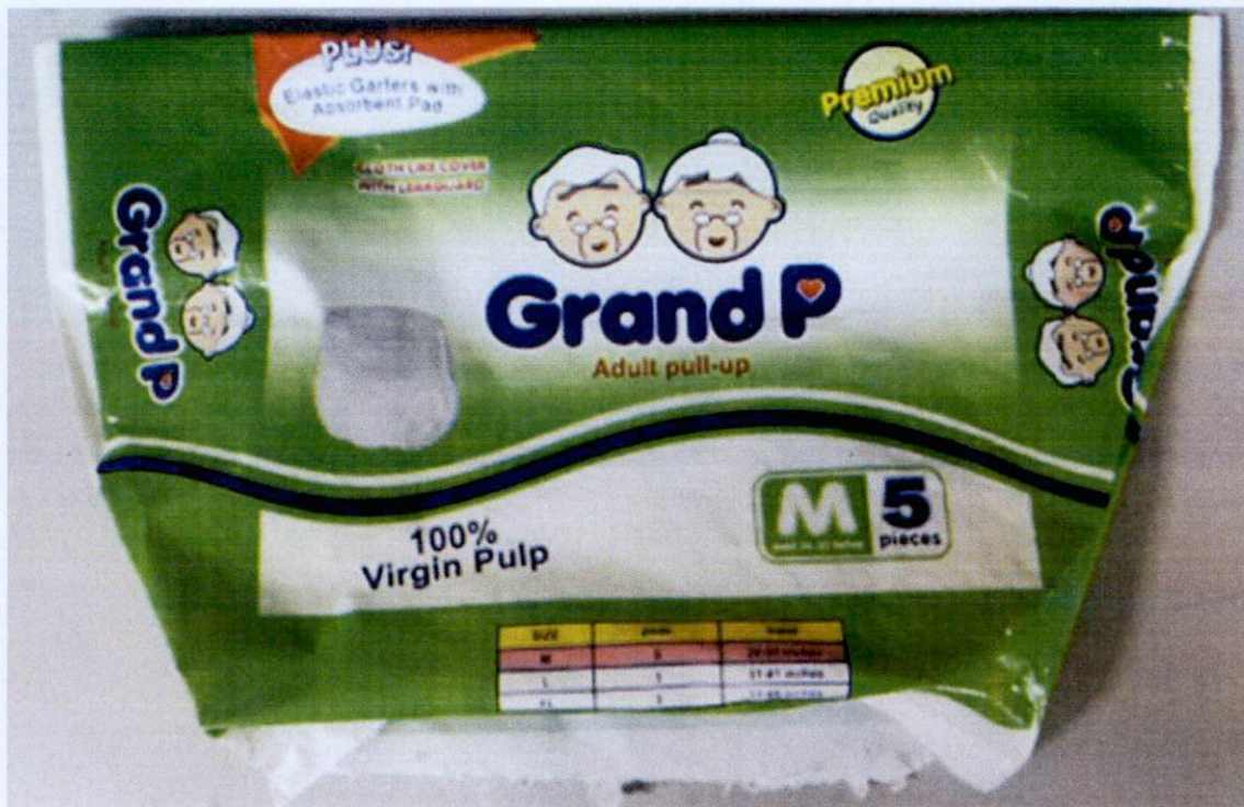
Figure 1. Unnotified Grand P Adult Pull-up

The Food and Drug Administration (FDA) warns all healthcare professionals and the general public NOT TO PURCHASE AND USE the unnotified medical device product: