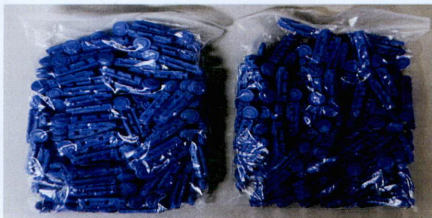
Figure 1. Unregistered Medical Depot Blood Lancets