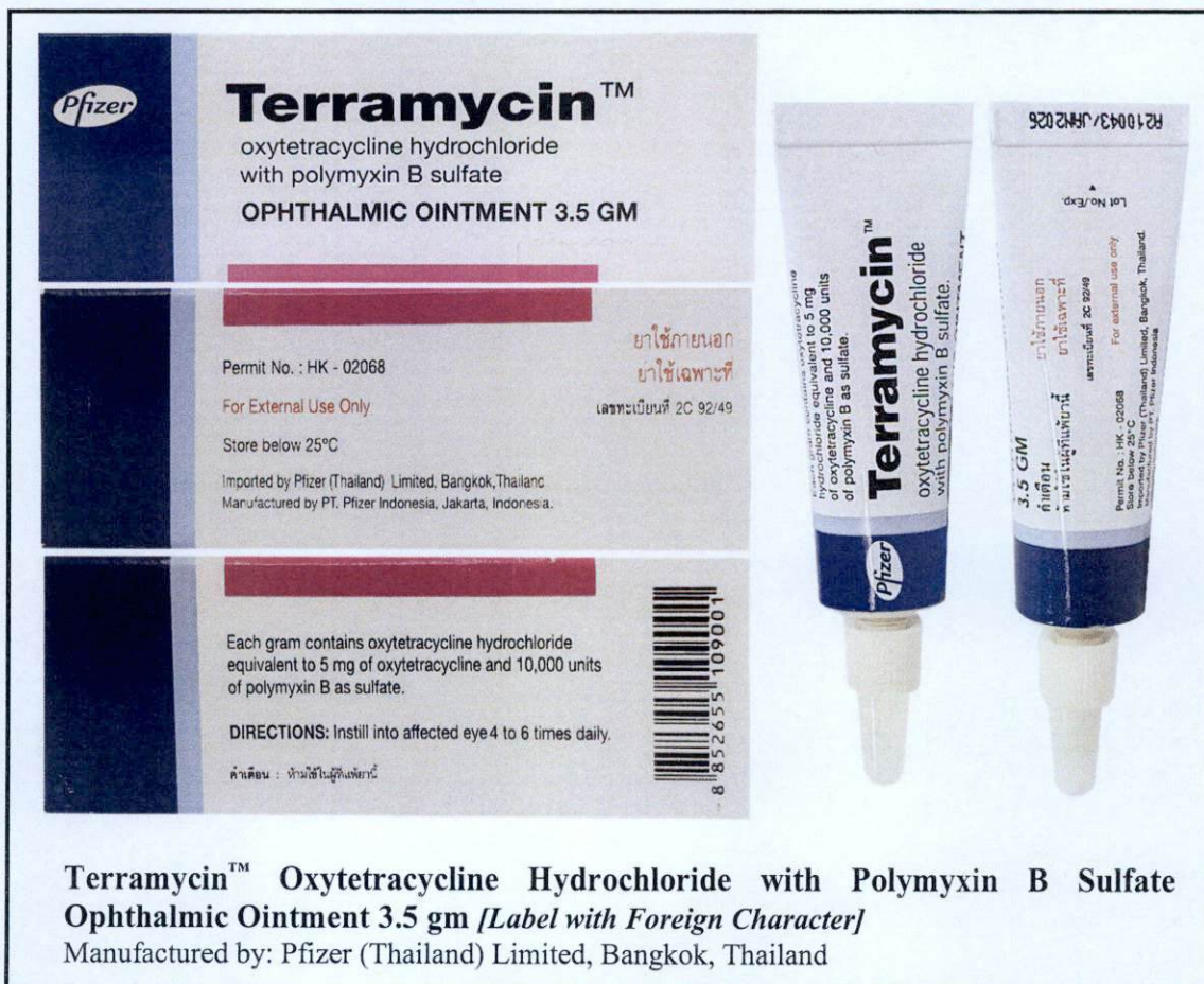
Terramycin™ Oxytetracycline Hydrochloride with Polymyxin B Sulfate Ophthalmic Ointment 3.5 gm [Label with Foreign Character] Manufactured by: Pfizer (Thailand) Limited, Bangkok, Thailand

The Food and Drug Administration (FDA) advises the public against the purchase and use of the following unregistered drug products: