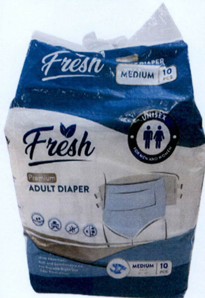
Figure 1. Unnotified Fresh Premium Adult Diaper - M

The Food and Drug Administration (FDA) warns all healthcare professionals and the general public NOT TO PURCHASE AND USE the unnotified medical device product: