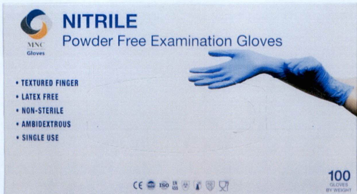
Figure 1. Unnotified MNC Nitrile Powder Free Examination Gloves

The Food and Drug Administration (FDA) warns all healthcare professionals and the general public NOT TO PURCHASE AND USE the unnotified medical device product: