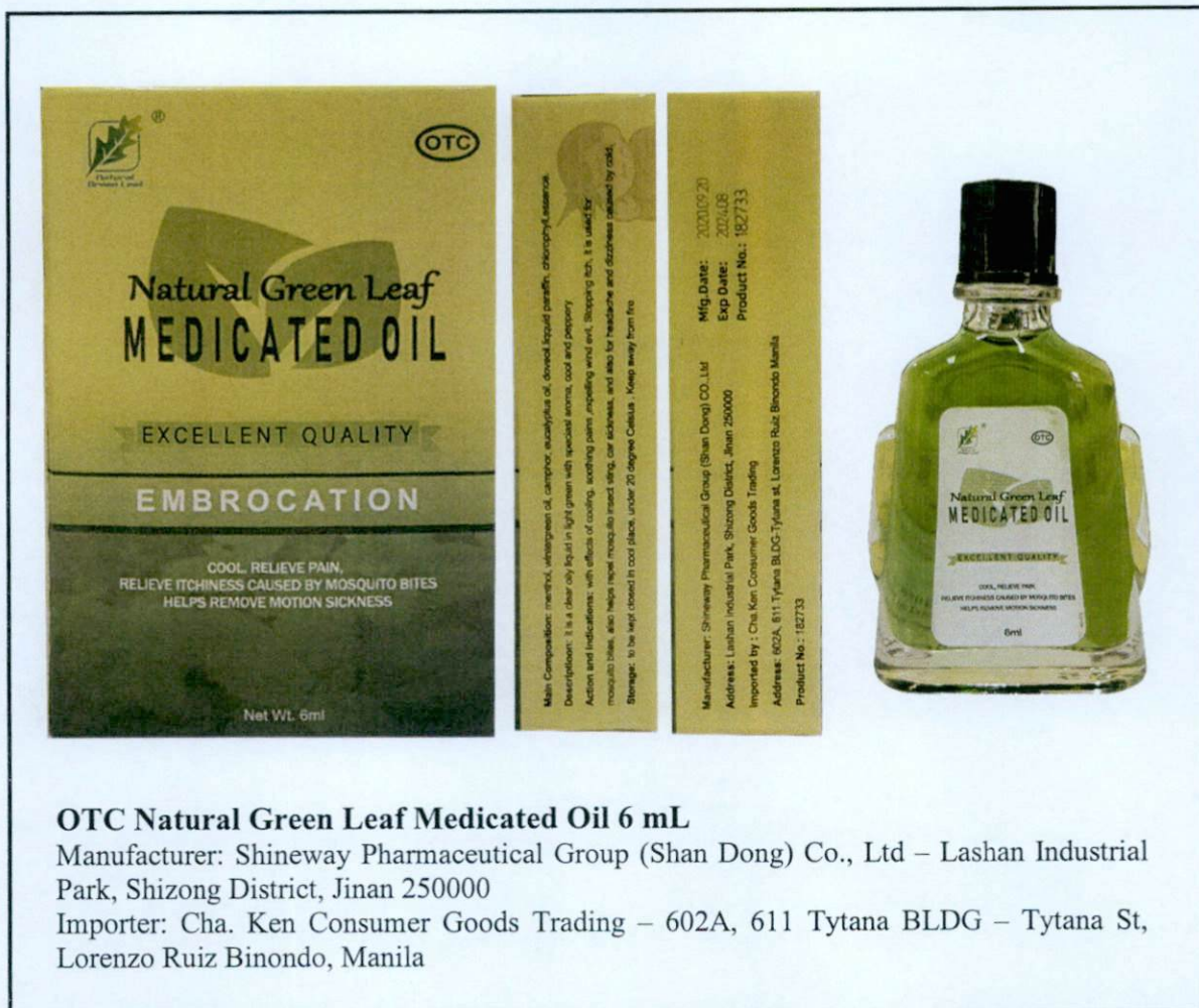
Figure 2. Unregistered drug product

FDA Post-Marketing Surveillance (PMS) activities have verified that the abovementioned drug products have not gone through the registration process of the Agency and have not been issued with proper authorization in the form of Certificate of Product Registration. Thus, the Agency cannot guarantee their quality, safety and efficacy. Therefore, consumption of such violative products may pose potential danger or injury to health.