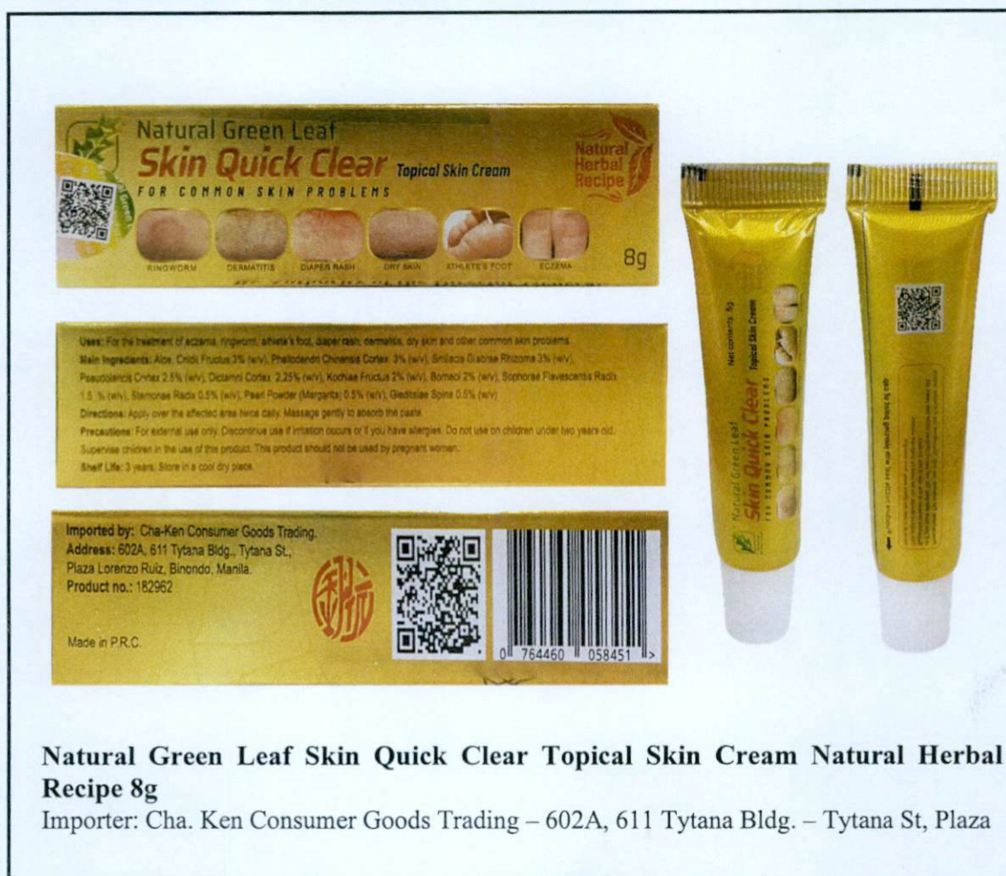
Figure 1. Unregistered drug product

The Food and Drug Administration (FDA) advises the public against the purchase and use of the following unregistered drug products: