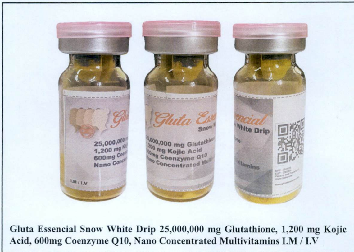
Gluta Essencial Snow White Drip 25,000,000 mg Glutathione, 1,200 mg Kojic Acid, 600mg Coenzyme Q10, Nano Concentrated Multivitamins I.M / I.V

The Food and Drug Administration (FDA) advises the public against the purchase and use of the following unregistered drug products: