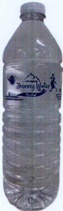
Figure 1. Unregistered JHONNY WATER Purified Drinking Water

The Food and Drug Administration (FDA) warns all healthcare professionals and the general public NOT TO PURCHASE AND CONSUME the following unregistered food products and food supplement: