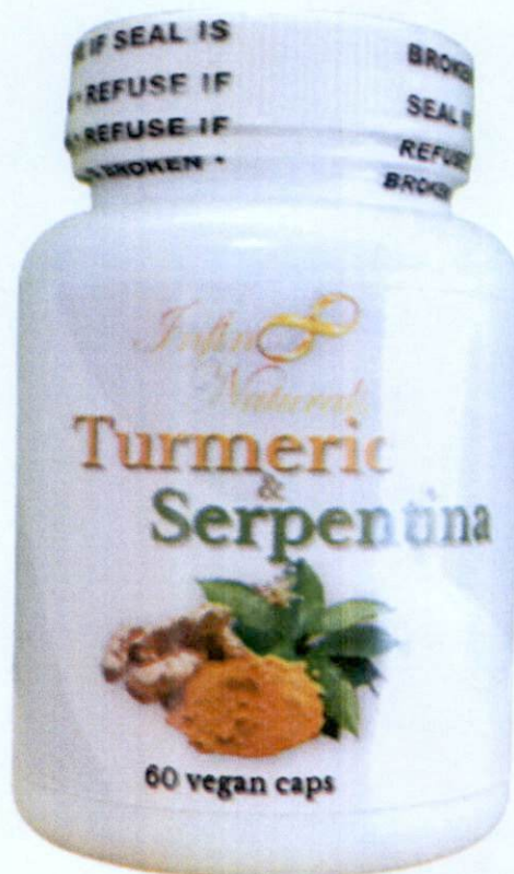
Figure 3. Unregistered INFINITE NATURALS Turmeric and Serpentina Capsules