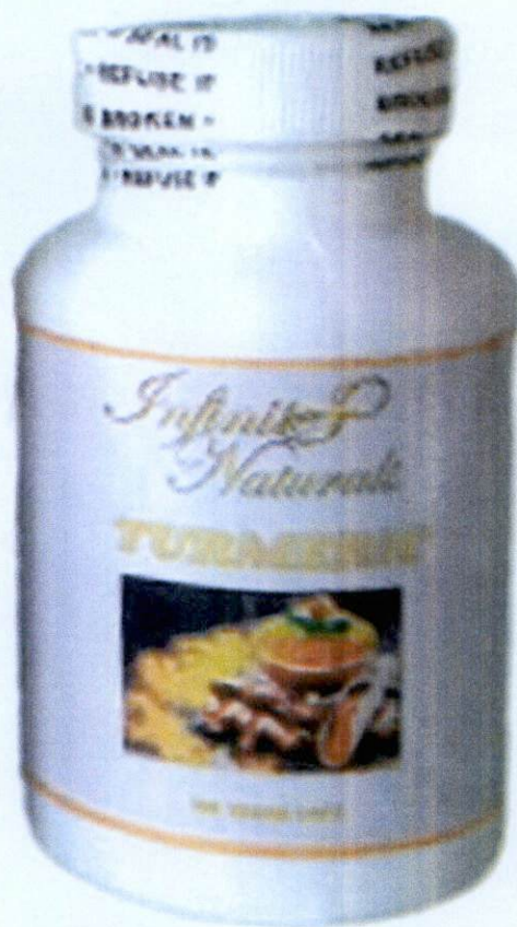
Figure 2. Unregistered INFINITE NATURALS Turmeric Capsules