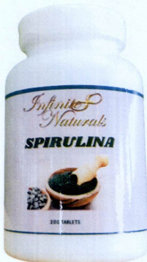
Figure 3. Unregistered INFINITE NATURALS Spirulina Capsules