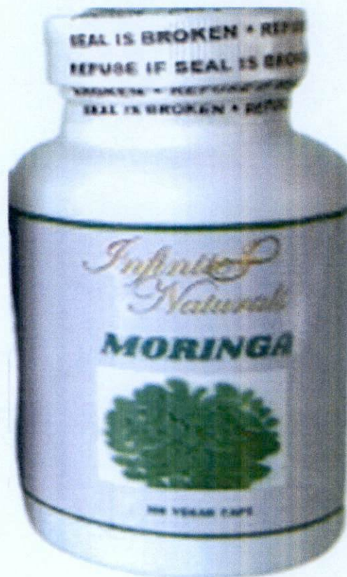
Figure 1. Unregistered INFINITE NATURALS Moringa Capsules

The Food and Drug Administration (FDA) warns all healthcare professionals and the general public NOT TO PURCHASE AND CONSUME the following unregistered food supplements: