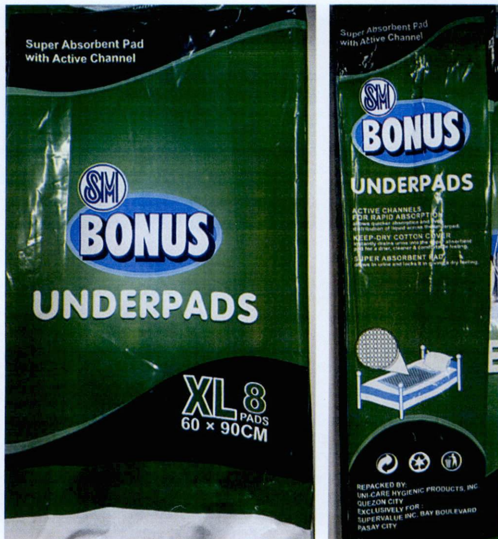
Figure 1. Unnotified SM Bonus Underpads

The Food and Drug Administration (FDA) warns all healthcare professionals and the general public NOT TO PURCHASE AND USE the unnotified medical device products: