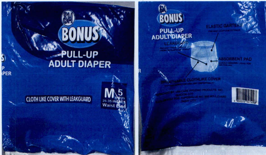
Figure 2. Unnotified SM Bonus Pull-up Adult Diaper

The FDA verified through post-marketing surveillance that the abovementioned medical device products are not notified and no corresponding Product Notification Certificate has been issued. Pursuant to the Republic Act No. 9711, otherwise known as the “Food and Drug Administration Act of 2009”, the manufacture, importation, exportation, sale, offering for sale, distribution, transfer, non-consumer use, promotion, advertising or sponsorship of health products without the proper authorization is prohibited.