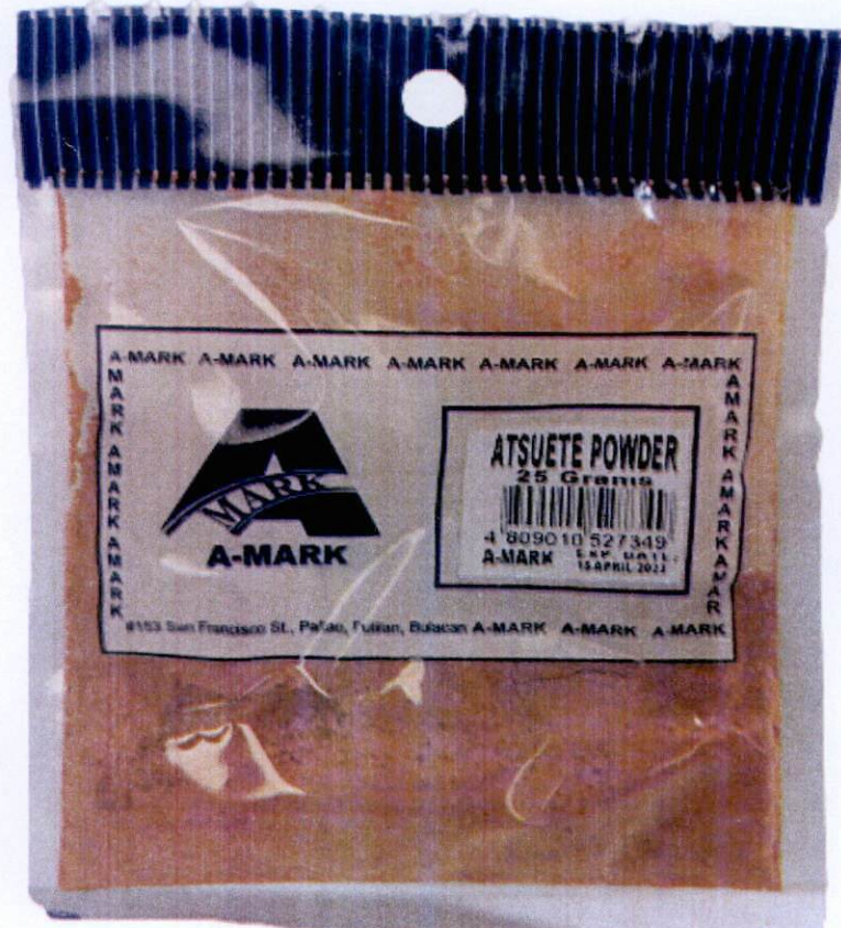
Figure 1. Unregistered A-MARK Atsuete Powder

The Food and Drug Administration (FDA) warns all healthcare professionals and the general public NOT TO PURCHASE AND CONSUME the unregistered food product: