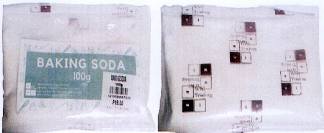
Figure 1. Unregistered UNBRANDED Baking Soda

The Food and Drug Administration (FDA) warns all healthcare professionals and the general public NOT TO PURCHASE AND CONSUME the unregistered food product: