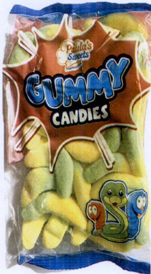
Figure 1. Unregistered PAULA'S SWEETS FOOD PRODUCTS Gummy Candies

The Food and Drug Administration (FDA) warns all healthcare professionals and the general public NOT TO PURCHASE AND CONSUME the unregistered food product: