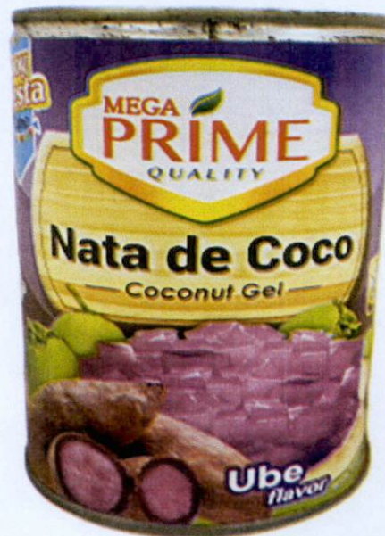
Figure 2. Unregistered MEGA PRIME QUALITY Nata de Coco Coconut Gel Ube Flavor