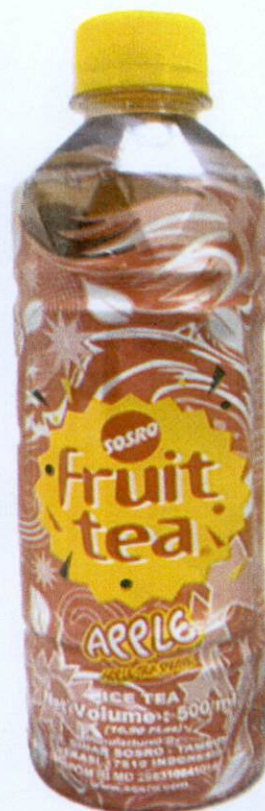
Figure 4. Unregistered SOSRO Fruit Tea Apple Apple Tea Drink Ice Tea

The FDA verified through online monitoring or post-marketing surveillance that the abovementioned food products are not registered and no corresponding Certificates of Product Registration (CPR) have been issued. Pursuant to the Republic Act No. 9711, otherwise known as the “Food and Drug Administration Act of 2009”, the manufacture, importation, exportation, sale, offering for sale, distribution, transfer, non-consumer use, promotion, advertising or sponsorship of health products without the proper authorization is prohibited.