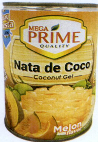
Figure 1. Unregistered MEGA PRIME QUALITY Nata de Coco Coconut Gel Melon Flavor

The Food and Drug Administration (FDA) warns all healthcare professionals and the general public NOT TO PURCHASE AND CONSUME the following unregistered food products: