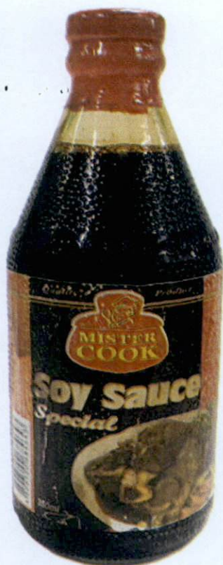
Figure 3. Unregistered MISTER COOK Soy Sauce Special