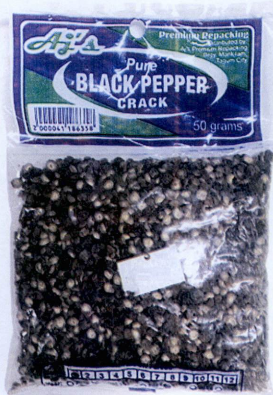
Figure 4. Unregistered AJ'S Pure Black Pepper Crack