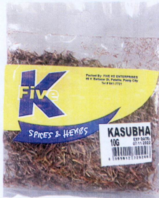
Figure 1. Unregistered FIVE K Spices and Herbs Kasubha

The Food and Drug Administration (FDA) warns all healthcare professionals and the general public NOT TO PURCHASE AND CONSUME the following unregistered food products: