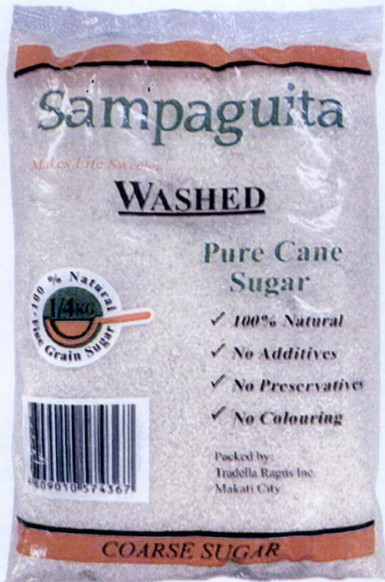
Figure 2. Unregistered SAMPAGUITA Washed Coarse Sugar Pure Cane Sugar