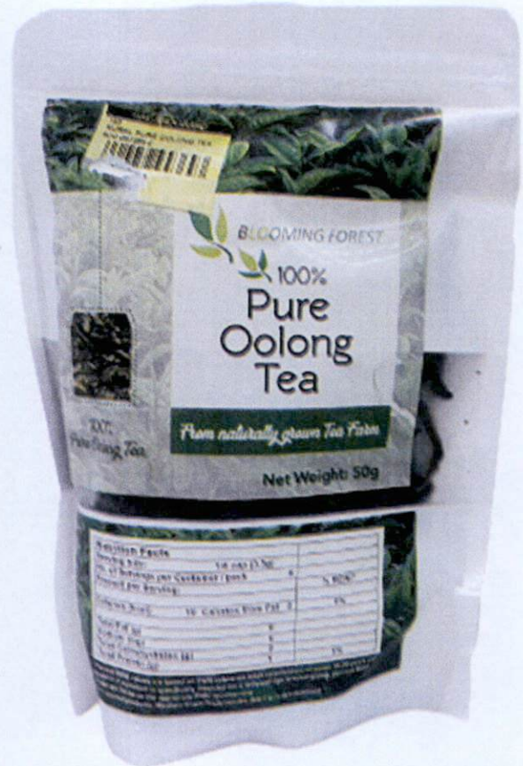
Figure 3. Unregistered BLOOMING FOREST 100% Pure Oolong Tea