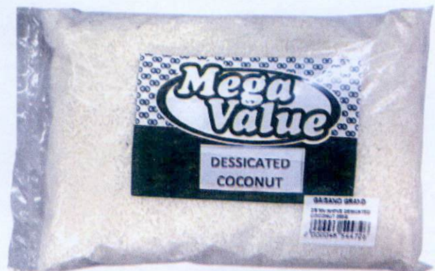
Figure 5. Unregistered MEGA VALUE Dessicated Coconut