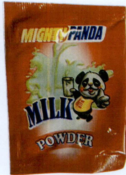
Figure 3. Unregistered MIGHTY PANDA Milk Powder