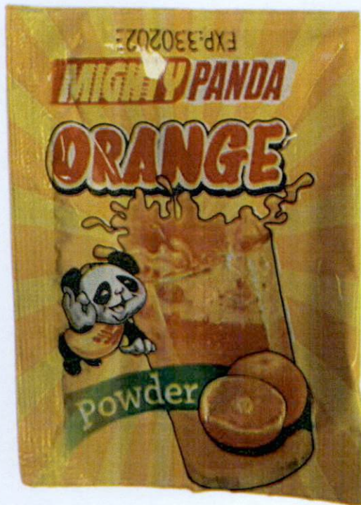
Figure 4. Unregistered MIGHTY PANDA Orange Powder