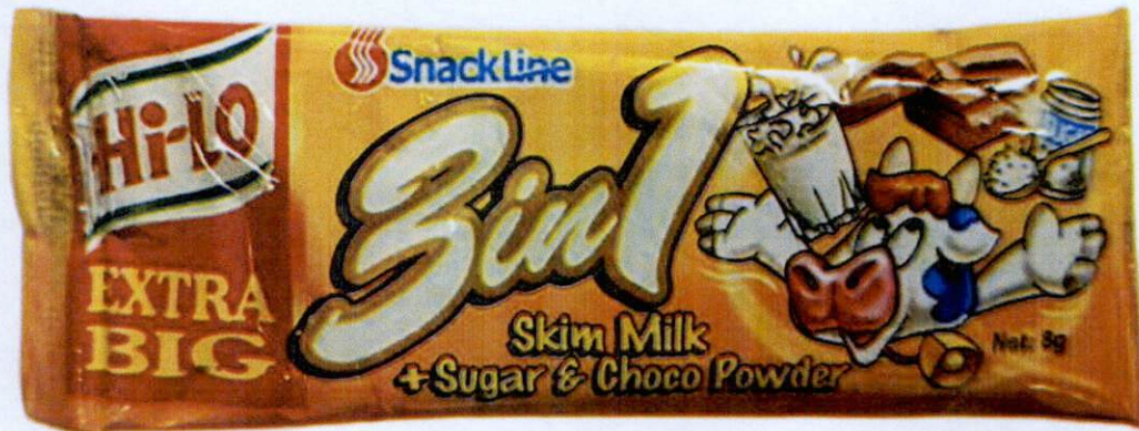
Figure 1. Unregistered SNACKLINE 3in1 Skim Milk + Sugar & Choco Powder Hi-Lo Extra Big

The Food and Drug Administration (FDA) warns all healthcare professionals and the general public NOT TO PURCHASE AND CONSUME the following unregistered food products: