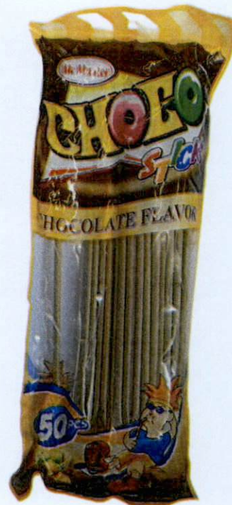
Figure 5. Unregistered MCMaster Choco Stick Chocolate Flavor