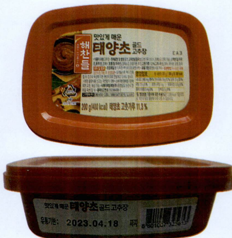
Figure 1. Unregistered Food product in red packaging (In Foreign Language)

The Food and Drug Administration (FDA) warns all healthcare professionals and the general public NOT TO PURCHASE AND CONSUME the following unregistered food products: