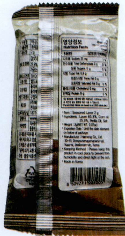
Figure 2. Unregistered HAENONG FOOD COMPANY Seasoned Laver (In Foreign Language)