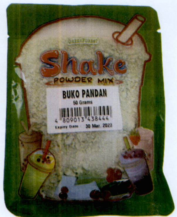
Figure 4. Unregistered GREEN FOREST Shake Powder Mix Buko Pandan