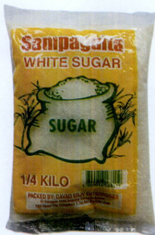
Figure 5. Unregistered SAMPAGUITA White Sugar

The FDA verified through online monitoring or post-marketing surveillance that the abovementioned food products are not registered and no corresponding Certificates of Product Registration (CPR) have been issued. Pursuant to the Republic Act No. 9711, otherwise known as the “Food and Drug Administration Act of 2009”, the manufacture, importation, exportation, sale, offering for sale, distribution, transfer, non-consumer use, promotion, advertising or sponsorship of health products without the proper authorization is prohibited.