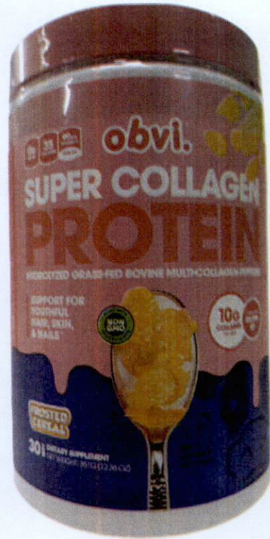
Figure 3. OBVI.® Super Collagen Protein Hydrolyzed Grass-Fed Bovine Multi-Collagen Peptides Frosted Cereal Dietary Supplement