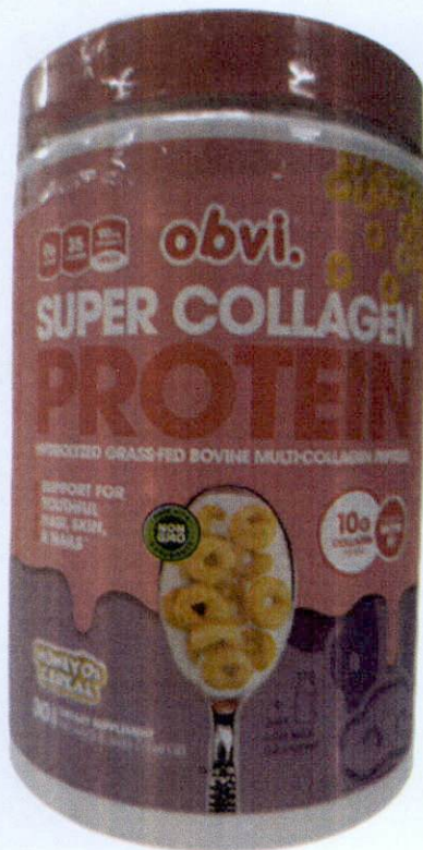
Figure 4. Unregistered OBVI.® Super Collagen Protein Hydrolyzed Grass-Fed Bovine Multi-Collagen Peptides Honey'os Cereal Dietary Supplement