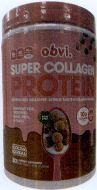
Figure 2. Unregistered OBVI.® Super Collagen Protein Hydrolyzed Grass-Fed Bovine Multi-Collagen Peptides Cocoa Cereal Dietary Supplement