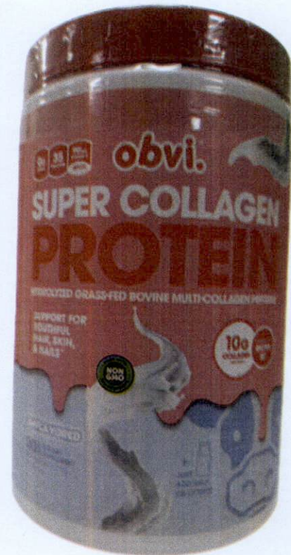
Figure 5. Unregistered OBVI.® Super Collagen Protein Hydrolyzed Grass-Fed Bovine Multi-Collagen Peptides Unflavored Dietary Supplement