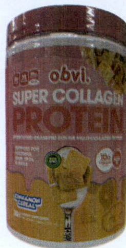
Figure 1. Unregistered OBVI.® Super Collagen Protein Hydrolyzed Grass-Fed Bovine Multi-Collagen Peptides Cinnamon Cereal Dietary Supplement

The Food and Drug Administration (FDA) warns all healthcare professionals and the general public NOT TO PURCHASE AND CONSUME the following unregistered food supplements: