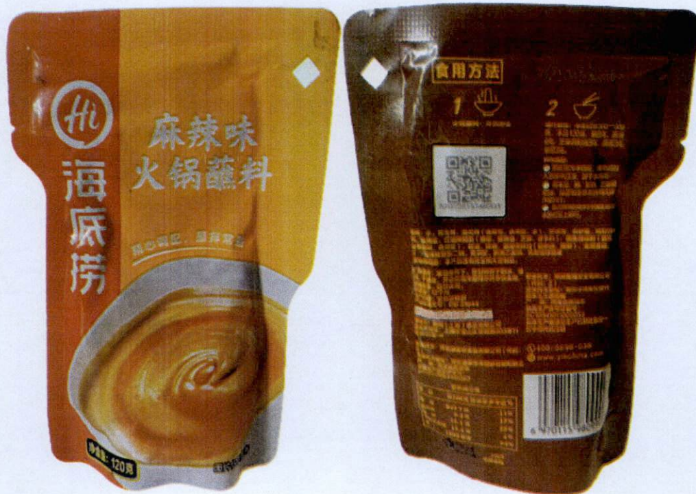
Figure 1. Unregistered PRODUCT IN RED AND ORANGE COLOR PACKED IN POUCH (In foreign language)

The Food and Drug Administration (FDA) warns all healthcare professionals and the general public NOT TO PURCHASE AND CONSUME the unregistered food product: