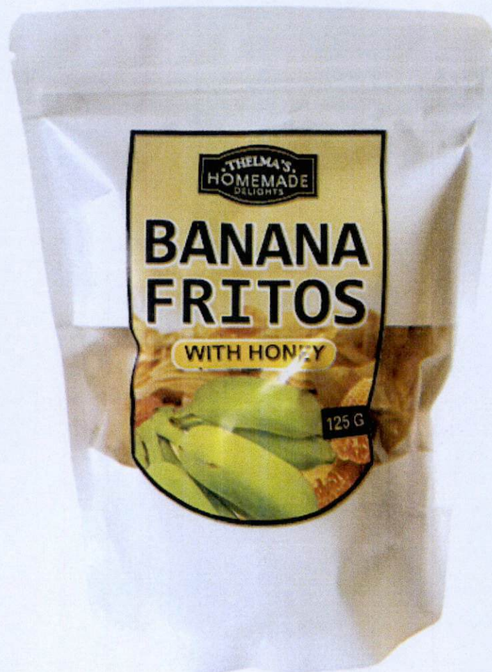
Figure 1. Unregistered THELMA'S HOMEMADE DELIGHTS Banana Fritos with Honey

The Food and Drug Administration (FDA) warns all healthcare professionals and the general public NOT TO PURCHASE AND CONSUME the unregistered food product: