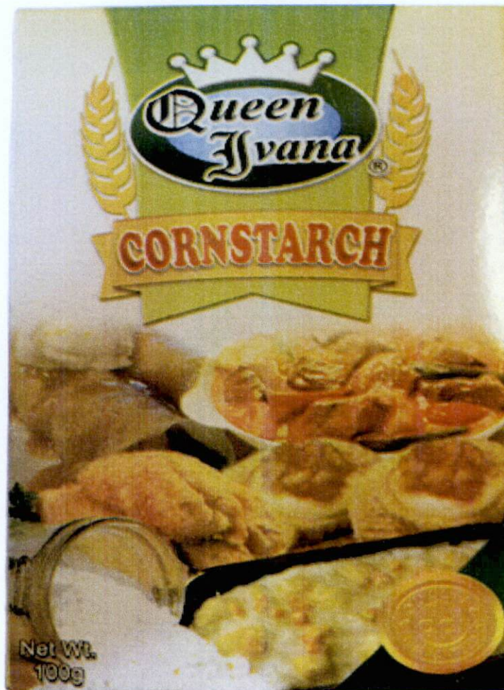
Figure 1. Unregistered QUEEN IVANA Cornstarch

The Food and Drug Administration (FDA) warns all healthcare professionals and the general public NOT TO PURCHASE AND CONSUME the unregistered food product: