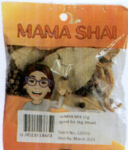
Figure 2. Unregistered MAMA SHAI Humba Mix