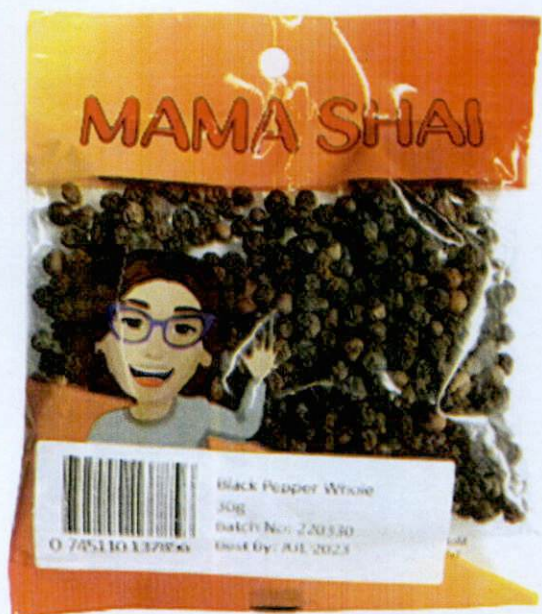
Figure 5. Unregistered MAMA SHAI Black Pepper Whole