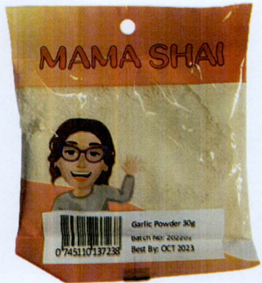
Figure 3. Unregistered MAMA SHAI Garlic Powder