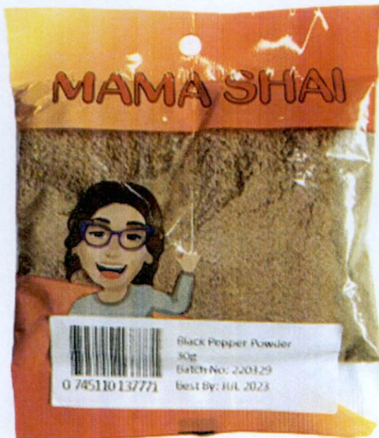
Figure 4. Unregistered MAMA SHAI Black Pepper Powder