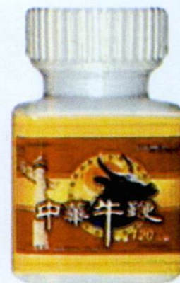
Figure 1. Unregistered Red and Yellow Packaging with Image of Carabao (In Foreign Language)