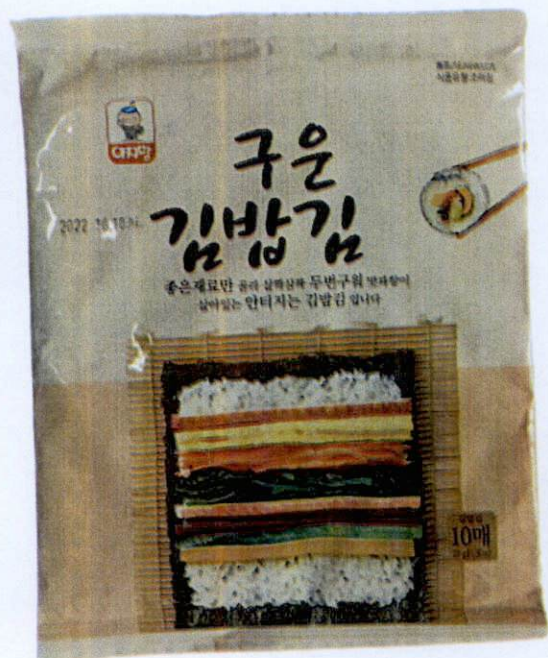
Figure 5. Unregistered Seaweeds in Foreign Language