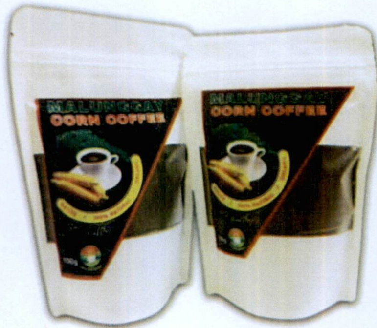
Figure 1. Unregistered UNBRANDED Malunggay Corn Coffee

The Food and Drug Administration (FDA) warns all healthcare professionals and the general public NOT TO PURCHASE AND CONSUME the following unregistered food products: