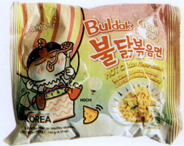
Figure 3. Unregistered SAMYANG Buldak Cream Carbonara Hot Chicken Flavor Ramen