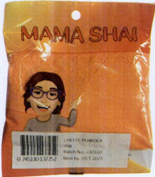
Figure 2. Unregistered MAMA SHAI Cheese Powder