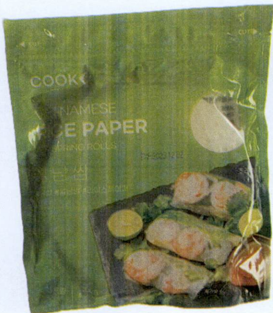
Figure 4. Unregistered COOK Vietnamese Rice Paper for Spring Rolls in Foreign Language