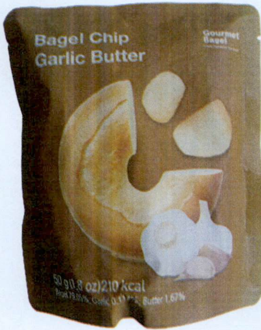
Figure 2. Unregistered GOURMET BAGEL Bagel Chip Garlic Butter