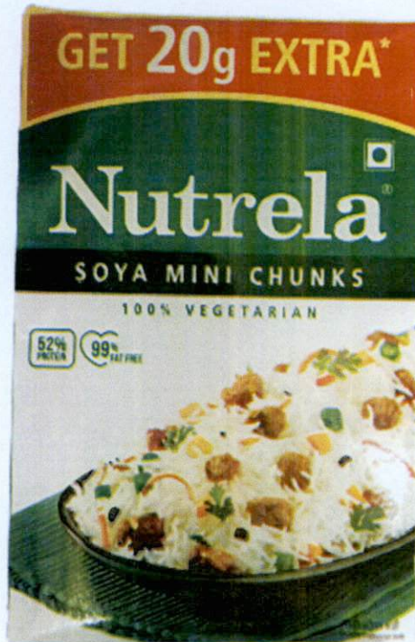
Figure 1. Unregistered NUTRELA Soya Mini Chunks

The Food and Drug Administration (FDA) warns all healthcare professionals and the general public NOT TO PURCHASE AND CONSUME the following unregistered food products: