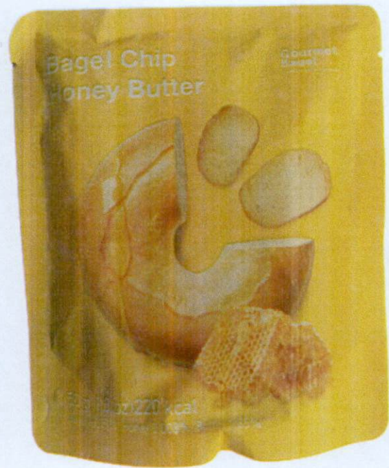
Figure 3. Unregistered GOURMET BAGEL Bagel Chip Honey Butter