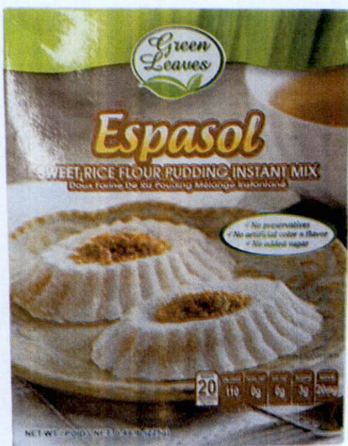
Figure 4. Unregistered GREEN LEAVES Espasol Sweet Rice Flour Pudding Instant Mix