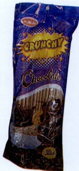
Figure 5. Unregistered MCMASTER Crunchy Chocolate