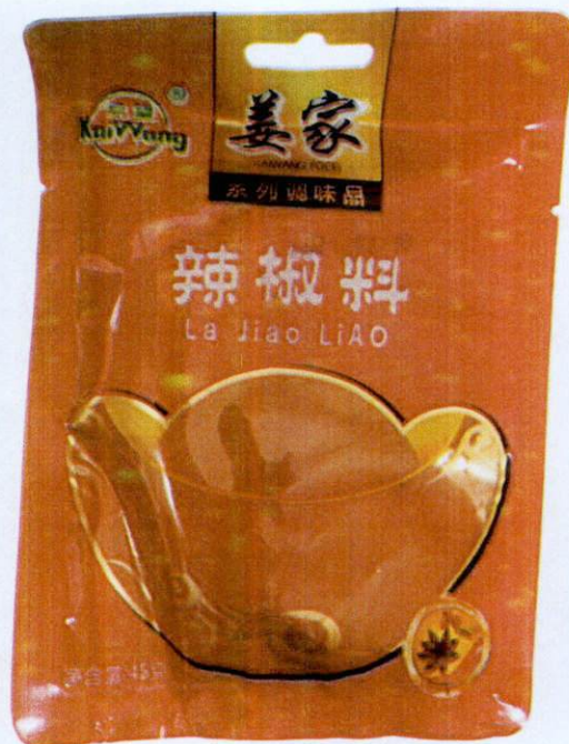
Figure 3. Unregistered KAIWANG FOOD La Jiao Liao In Foreign Language