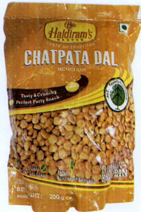
Figure 1. Unregistered HALDIRAM'S NAGPUR TASTE OF TRADITION Chatpata Dal

The Food and Drug Administration (FDA) warns all healthcare professionals and the general public NOT TO PURCHASE AND CONSUME the following unregistered food products: