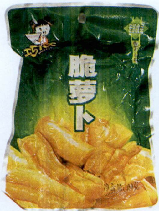
Figure 2. Unregistered QIAYATOU (Radish Preserves as Illustrated in Picture) In Foreign Language