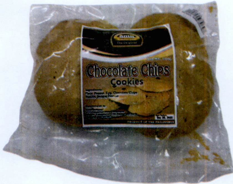
Figure 2. Unregistered ANTH DELICACY THE ORIGINAL Chocolate Chips Cookies