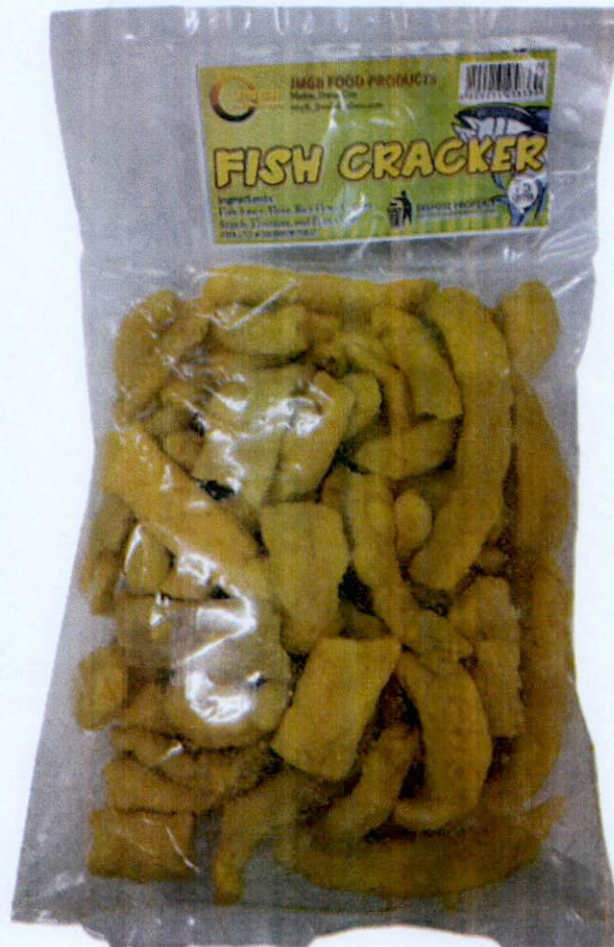
Figure 1. Unregistered MGB FOOD PRODUCTS Fish Cracker

The Food and Drug Administration (FDA) warns all healthcare professionals and the general public NOT TO PURCHASE AND CONSUME the following unregistered food products: