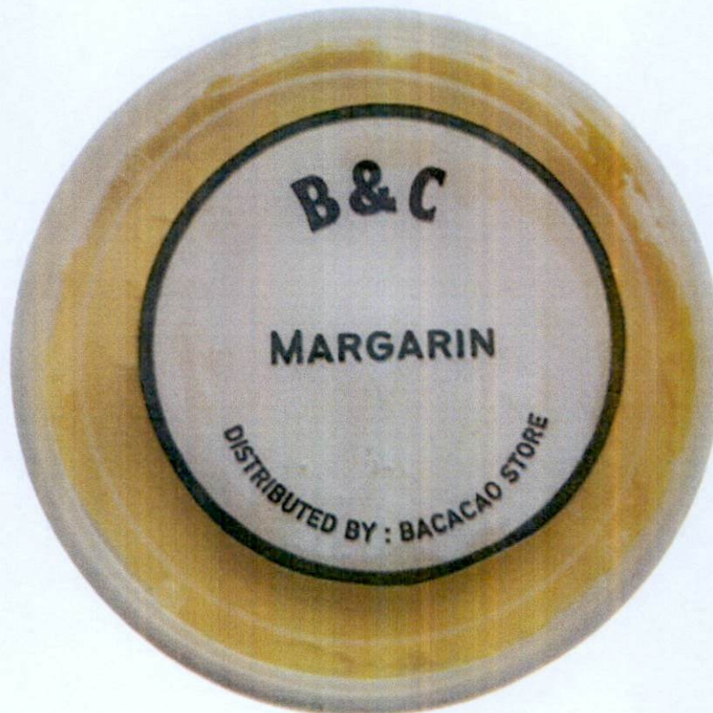
Figure 1. Unregistered B & C Margarin

The Food and Drug Administration (FDA) warns all healthcare professionals and the general public NOT TO PURCHASE AND CONSUME the following unregistered food products: