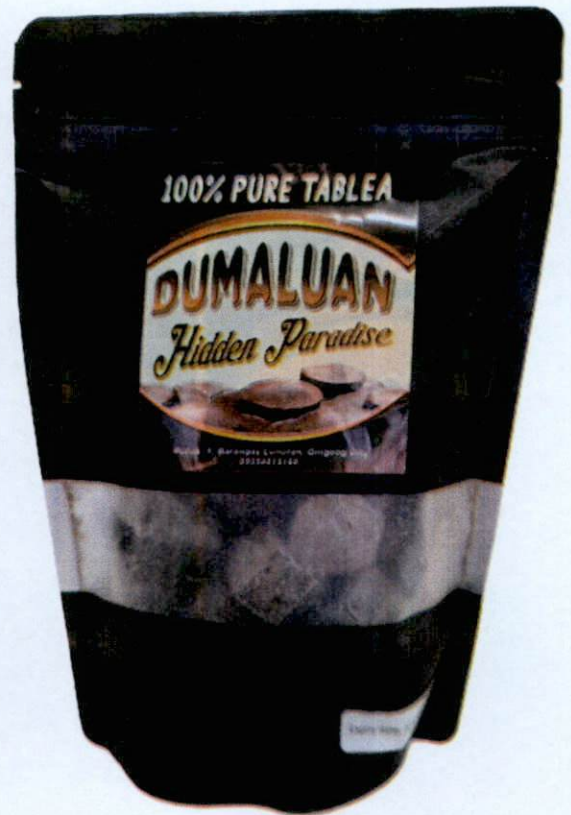
Figure 3. Unregistered DUMALUAN HIDDEN PARADISE 100% Pure Tablea