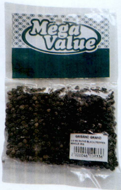
Figure 2. Unregistered MEGA VALUE Black Pepper Whole