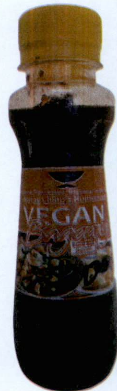
Figure 5. Unregistered NANAY CHING'S HOMEMADE Vegan Bagoong Extra Hot Flavor