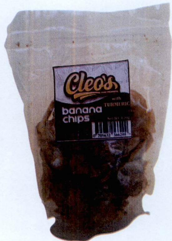
Figure 5. Unregistered CLEO'S FOOD PRODUCTS Banana Chips with Turmeric