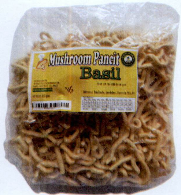
Figure 3. Unregistered DOALNARA PRODUCT Mushroom Pancit Basil