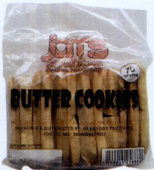
Figure 4. Unregistered JAMS REPACKING Butter Cookies