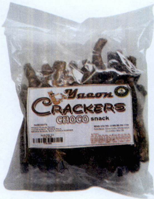
Figure 2. Unregistered DOALNARA PRODUCT Yacon Crackers Choco Snack