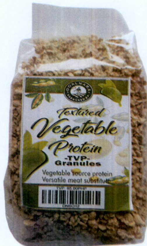
Figure 1. Unregistered Textured Vegetable Protein Granules

The Food and Drug Administration (FDA) warns all healthcare professionals and the general public NOT TO PURCHASE AND CONSUME the following unregistered food products: