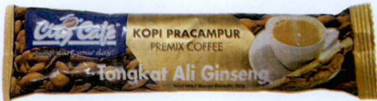
Figure 2. Unregistered CITY CAFE Kopi Pracampur Premix Coffee Tongkat Ali Ginseng