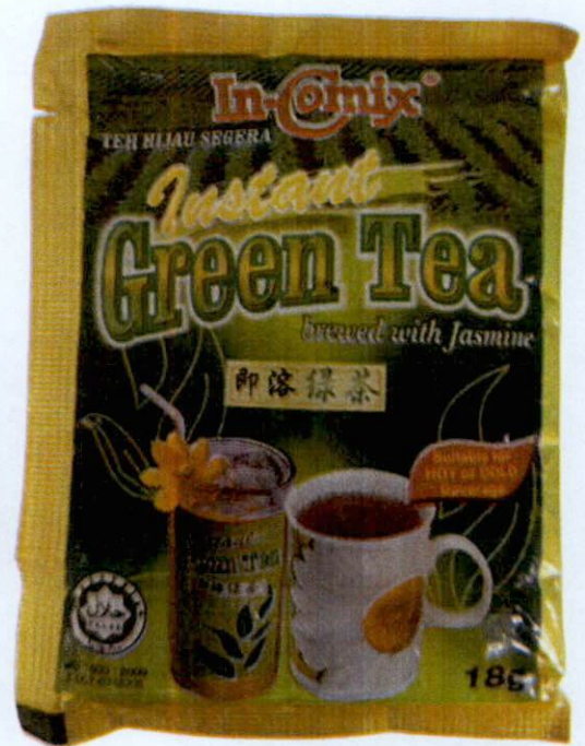
Figure 3. Unregistered IN-COMIX Instant Green Tea Brewed with Jasmine