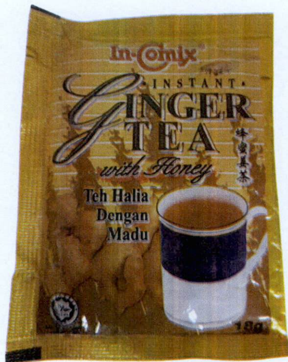
Figure 1. Unregistered IN-COMIX Instant Ginger Tea with Honey

The Food and Drug Administration (FDA) warns all healthcare professionals and the general public NOT TO PURCHASE AND CONSUME the following unregistered food products: