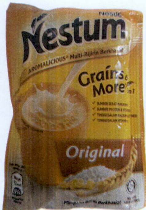
Figure 4. Unregistered NESTLE NESTUM Grains & More 3 in 1 Original