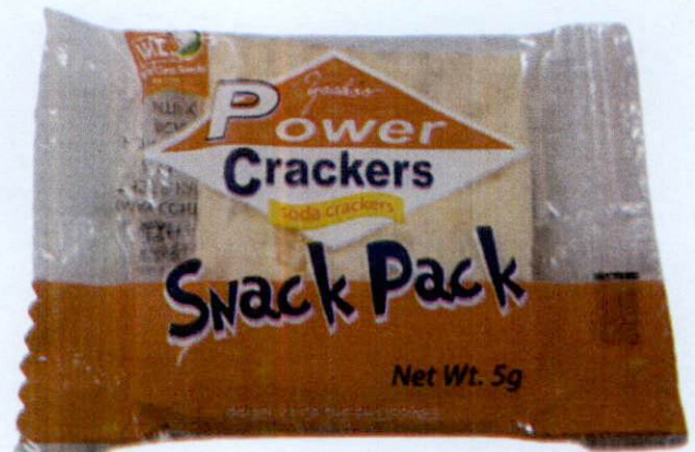
Figure 5. Unregistered W.L. YAAHOO POWER CRACKERS Soda Crackers Snack Pack