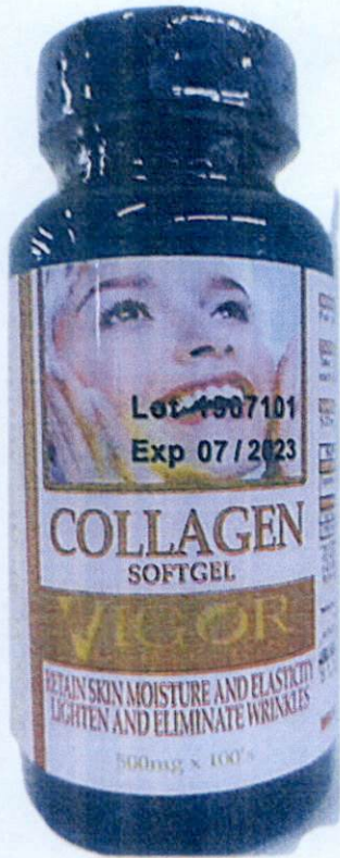
Figure 2. Unregistered VIGOR Collagen Softgel