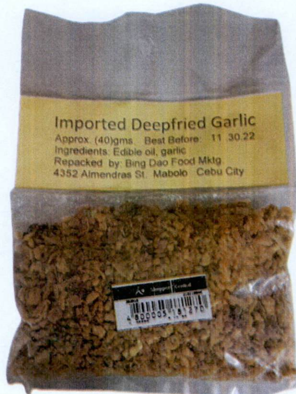
Figure 1. Unregistered Imported Deepfried Garlic

The Food and Drug Administration (FDA) warns all healthcare professionals and the general public NOT TO PURCHASE AND CONSUME the following unregistered food products and food supplements: