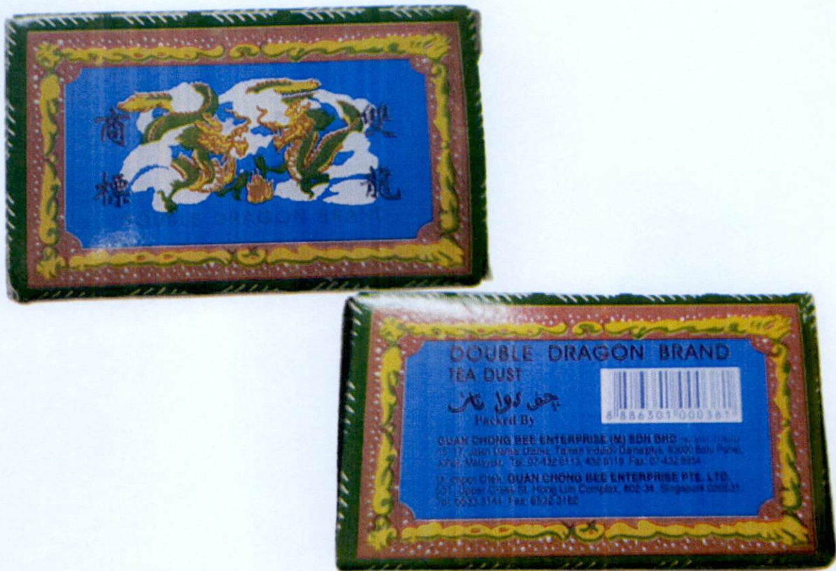
Figure 5. Unregistered DOUBLE DRAGON BRAND Tea Dust No. 666

The FDA verified through online monitoring or post-marketing surveillance that the abovementioned food products and food supplements are not registered and no corresponding Certificates of Product Registration (CPR) have been issued. Pursuant to the Republic Act No. 9711, otherwise known as the “Food and Drug Administration Act of 2009”, the manufacture, importation, exportation, sale, offering for sale, distribution, transfer, non-consumer use, promotion, advertising or sponsorship of health products without the proper authorization is prohibited.