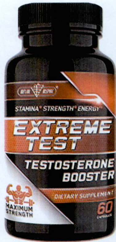
Figure 3. Unregistered EXTREME TEST Testosterone Booster for Men Dietary Supplement