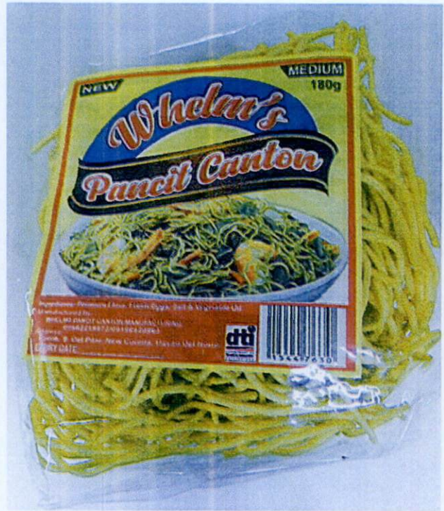
Figure 3. Unregistered WHELM'S Pancit Canton