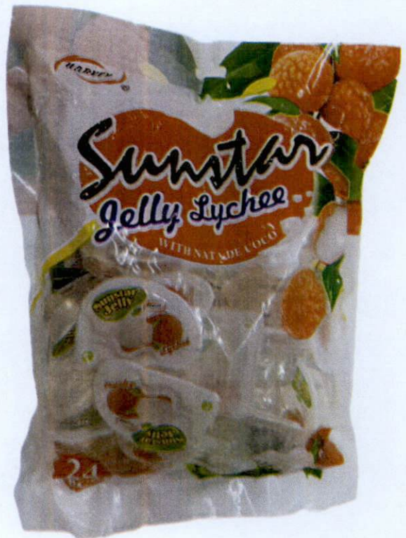
Figure 5. Unregistered HARVEY Sunstar Jelly Lychee with Nata De Coco