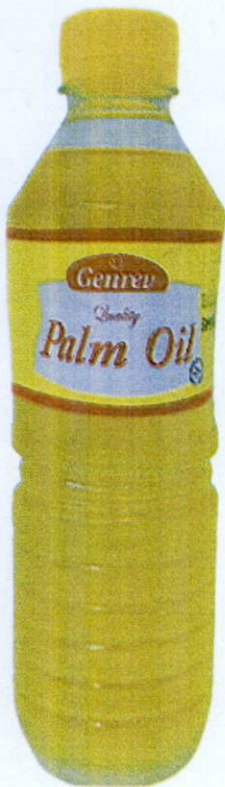
Figure 4. Unregistered GENREV Palm Oil