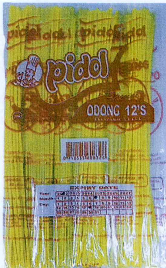
Figure 1. Unregistered PIDOL Special Odong Filipino Style

The Food and Drug Administration (FDA) warns all healthcare professionals and the general public NOT TO PURCHASE AND CONSUME the following unregistered food products: