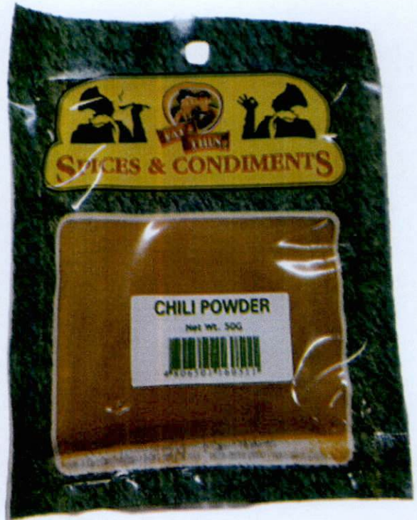
Figure 3. Unregistered FAT & THIN SPICES AND CONDIMENTS Chili Powder