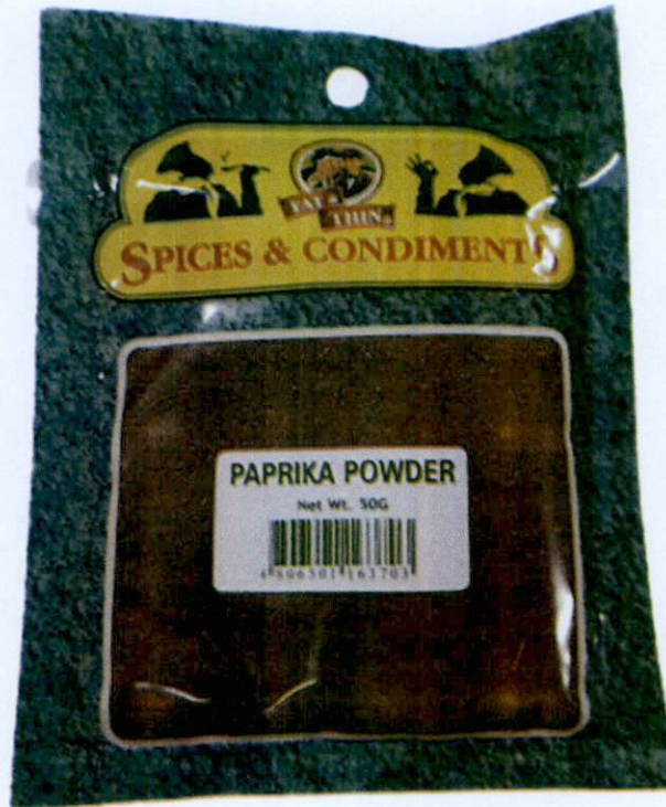
Figure 4. Unregistered FAT & THIN SPICES AND CONDIMENTS Paprika Powder