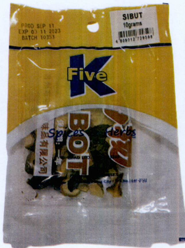
Figure 1. Unregistered FIVE K Sibut

The Food and Drug Administration (FDA) warns all healthcare professionals and the general public NOT TO PURCHASE AND CONSUME the following unregistered food products: