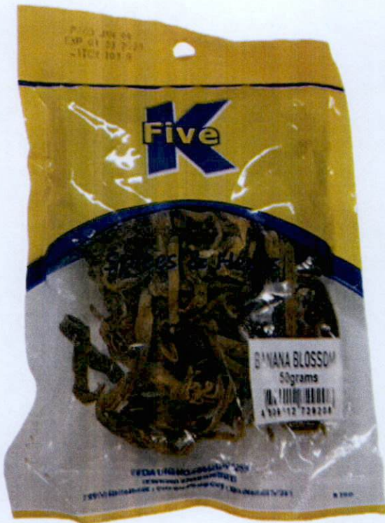
Figure 2. Unregistered FIVE K Banana Blossom