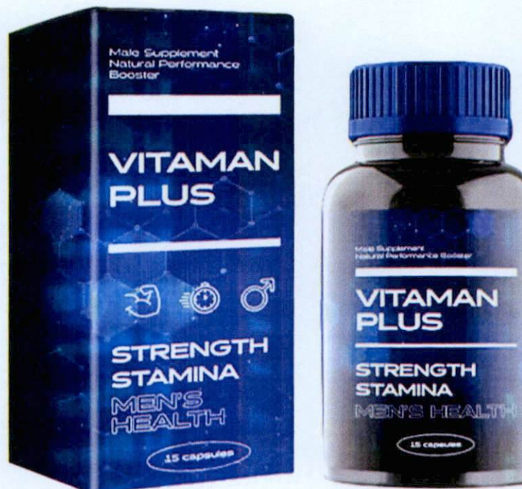
Figure 1. Unregistered VITAMAN PLUS Male Supplement Natural Performance Booster

The Food and Drug Administration (FDA) warns all healthcare professionals and the general public NOT TO PURCHASE AND CONSUME the following unregistered food supplements: