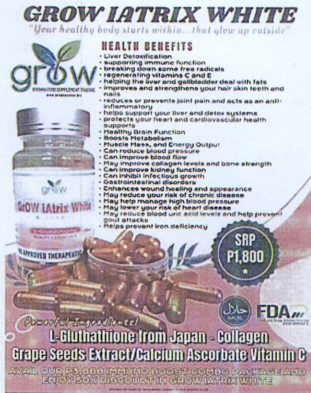
Figure 3. Unregistered GROWIN FOOD SUPPLEMENT TRADING Grow Iatrix White L-Glutathione Beauty Essentials Plus

The FDA verified through online monitoring or post-marketing surveillance that the abovementioned food supplements are not registered and no corresponding Certificates of Product Registration (CPR) have been issued. Pursuant to the Republic Act No. 9711, otherwise known as the “Food and Drug Administration Act of 2009”, the manufacture, importation, exportation, sale, offering for sale, distribution, transfer, non-consumer use, promotion, advertising or sponsorship of health products without the proper authorization is prohibited.