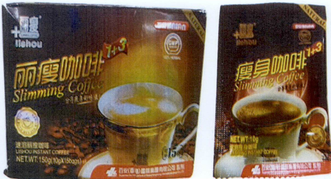
Figure 1. Unregistered LISHOU Slimming Coffee

The Food and Drug Administration (FDA) warns all healthcare professionals and the general public NOT TO PURCHASE AND CONSUME the unregistered food product: