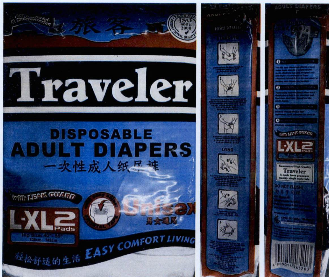
Figure 1. Unnotified Traveler Disposable Adult Diapers

The Food and Drug Administration (FDA) warns all healthcare professionals and the general public NOT TO PURCHASE AND USE the unnotified medical device product: