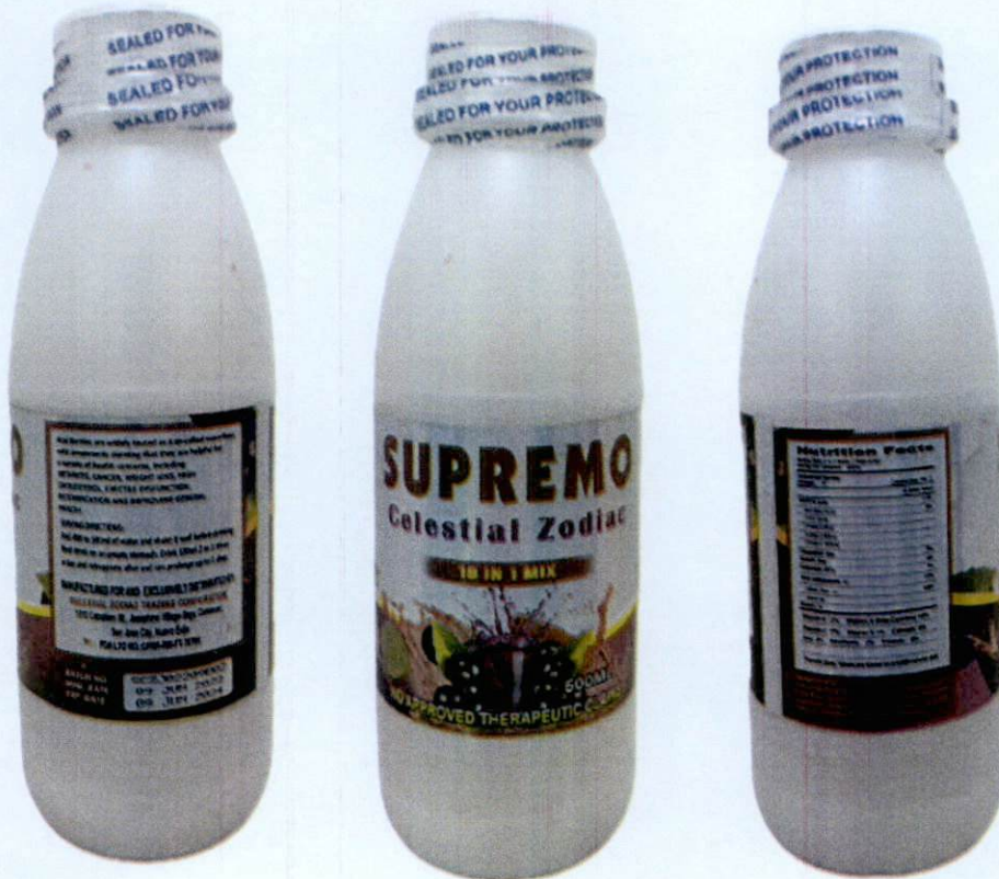
Figure 1. Unregistered SUPREMO CELESTIAL ZODIAC 18 in 1 Mix

The Food and Drug Administration (FDA) warns all healthcare professionals and the general public NOT TO PURCHASE AND CONSUME the unregistered food product: