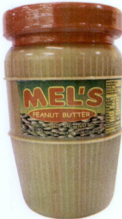
Figure 1. Unregistered MEL'S Peanut Butter 100% Pure Peanuts

The Food and Drug Administration (FDA) warns all healthcare professionals and the general public NOT TO PURCHASE AND CONSUME the unregistered food product: