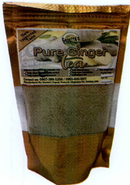
Figure 1. Unregistered GESETTE'S ORGANIC PRODUCTS Pure Ginger Tea

The Food and Drug Administration (FDA) warns all healthcare professionals and the general public NOT TO PURCHASE AND CONSUME the unregistered food product: