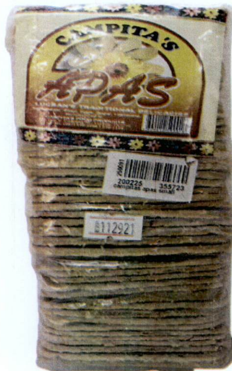
Figure 1. Unregistered CAMPITA'S Apas

The Food and Drug Administration (FDA) warns all healthcare professionals and the general public NOT TO PURCHASE AND CONSUME the unregistered food product: