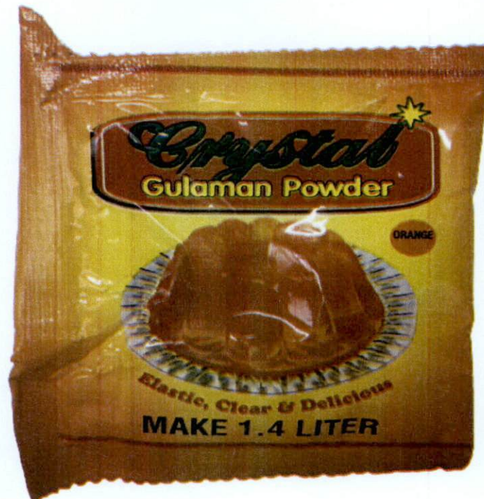
Figure 1. Unregistered CRYSTAL Gulaman Powder Elastic, Clear & Delicious Orange

The Food and Drug Administration (FDA) warns all healthcare professionals and the general public NOT TO PURCHASE AND CONSUME the unregistered food product: