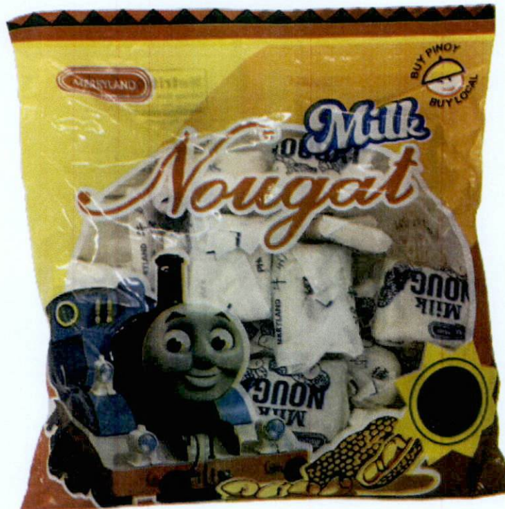
Figure 1. Unregistered MERRYLAND Milk Nougat

The Food and Drug Administration (FDA) warns all healthcare professionals and the general public NOT TO PURCHASE AND CONSUME the unregistered food product: