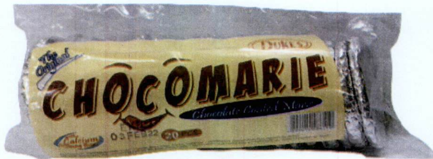
Figure 1. Unregistered DUKE'S Chocomarie Chocolate Coated Marie

The Food and Drug Administration (FDA) warns all healthcare professionals and the general public NOT TO PURCHASE AND CONSUME the unregistered food product: