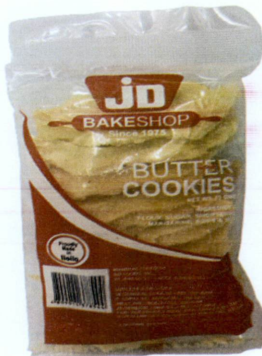
Figure 1. Unregistered JD BAKESHOP Butter Cookies

The Food and Drug Administration (FDA) warns all healthcare professionals and the general public NOT TO PURCHASE AND CONSUME the unregistered food product: