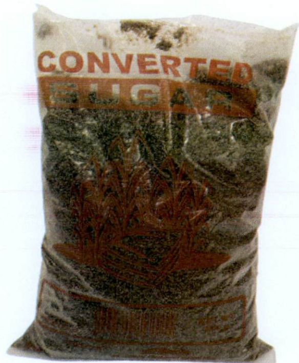
Figure 1. Unregistered CONVERTED Sugar

The Food and Drug Administration (FDA) warns all healthcare professionals and the general public NOT TO PURCHASE AND CONSUME the unregistered food product: